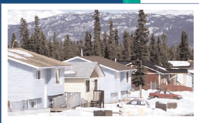
Energy Efficient Houses in Whitehorse, Yukon