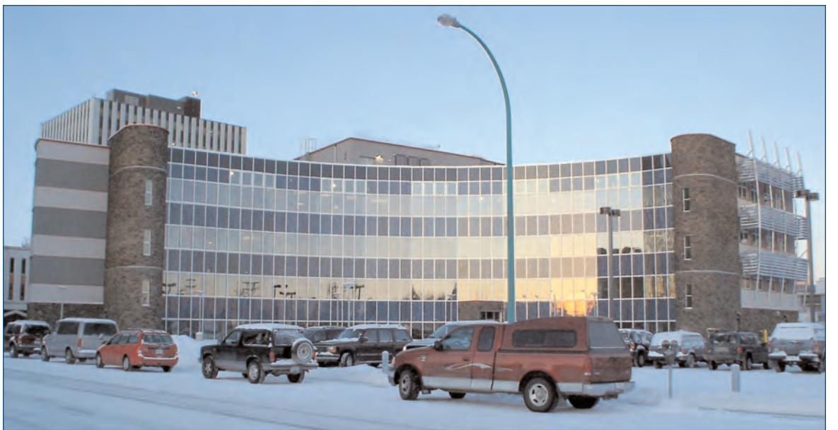
The new "Greenstone" building in Yellowknife, NWT is an excellent example of energy efficient building in the North.